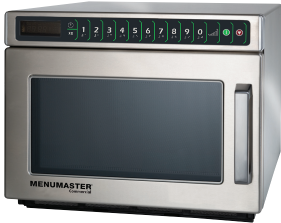
Model DEC18MU shown Designed specifically for operation in Singapore, Hong Kong, Malaysia