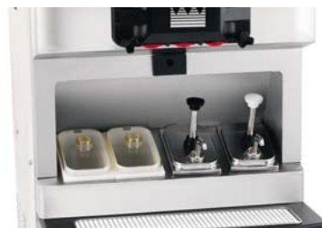
Integrated Syrup Rail Option - 2 room temperature with lids & ladles, 2 heated with syrup pumps

During long no-use periods, the standby feature maintains safe product temperatures in the mix hopper and freezing cylinder.