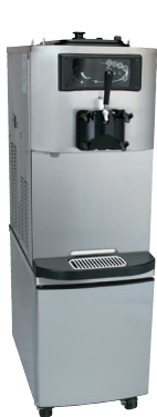
Optional Cart with front opening door

Protects the operator from injury as the beater will not operate without the dispensing door in place.