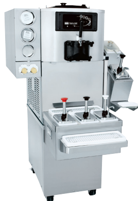
Optional Cart with rear door for front mount syrup rail