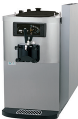
Optional Top Air Discharge Chute